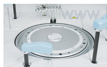
Reaction Tray 37±0.1°C, real-time monitor.