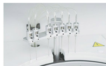
Washing Probe Independent 7-step washing system.