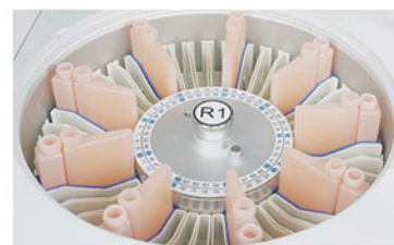
Reagent Tray 2~8°C cooling for 24 hours.