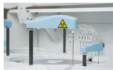
Sample Probe Liquid level sensor function. Anti-collision function. Sample volume real-time detection.