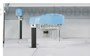
Mixer Probe Teflon coating to avoid cross contamination.